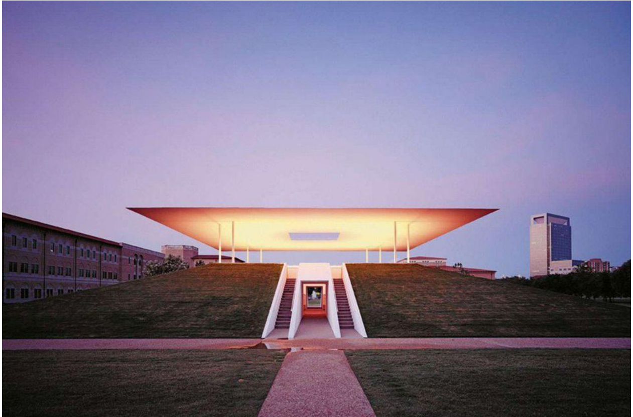
James Turrell's "Twilight Epiphany."

For coffee, drop by Boomtown for small-batch drinks or Southside Espresso for trendy, caffeinated staples like whites and cordatos.